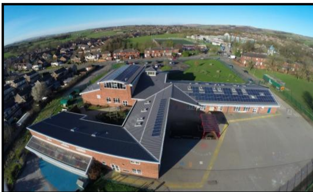
47kW of panels installed on Blackshaw primary school