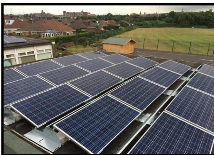
Mather Street Primary School

Non-UK residents must take responsibility for ensuring that there are no laws or regulations in their own country that would prevent them from investing in or receiving income from a UK Society.